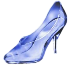
A GLASS SLIPPER