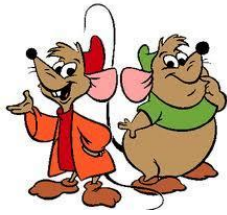
2 MICE( Δ A MOUSE)