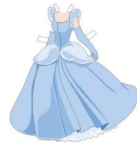
A GAWN = A DRESS