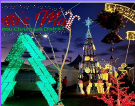
Santa's Mall 09/11/23 - 04/01/24